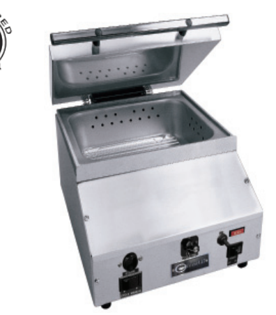
Installation and Service Manual - 8449-96

Automatic Timer/Push Button Operation Steamer with Direct Water Hookup